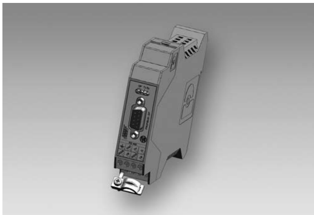
GK473 with Profibus-DP interface