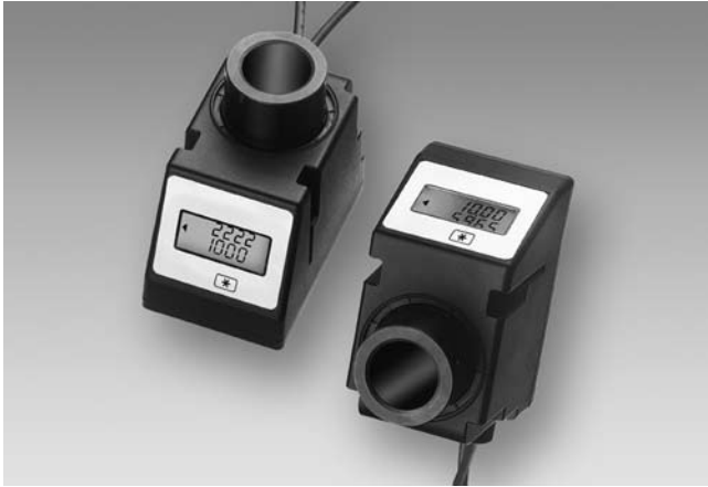
N 141 with cable output