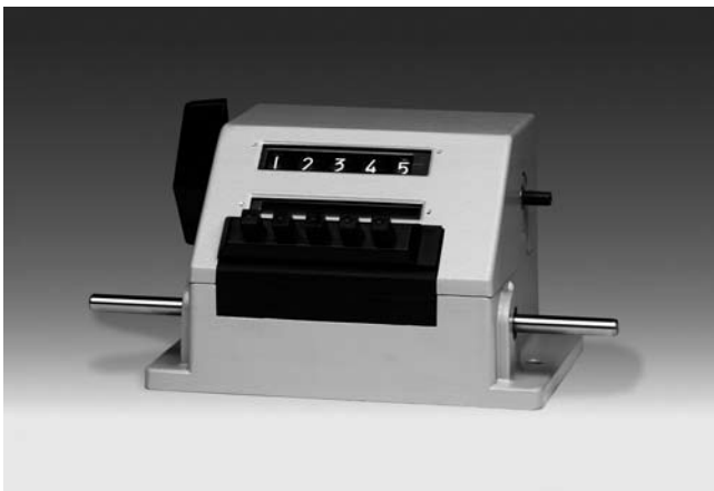
UE280 - Revolution counter