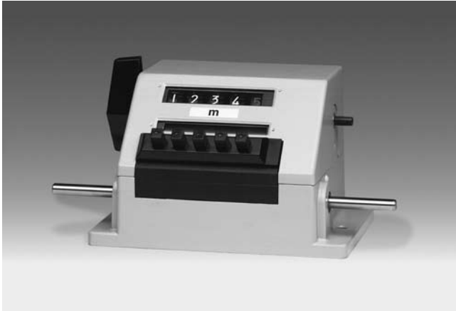
ME280 - Meter counter