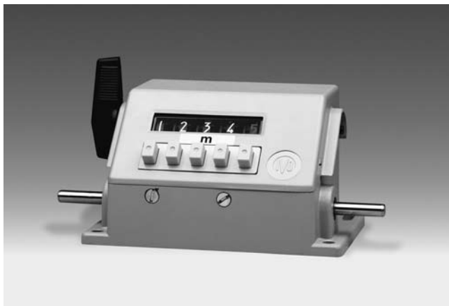
ME230 - Meter counter