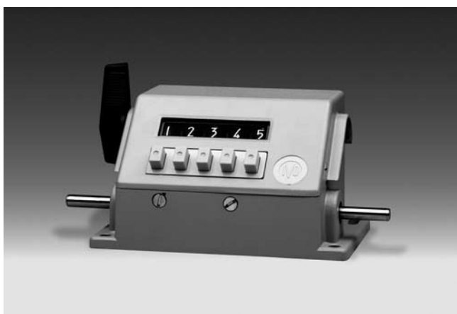
UE230 - Revolution counter