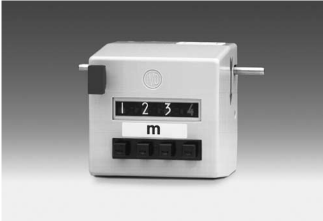
ME102 - Meter counter