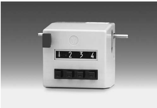
UE102 - Revolution counter