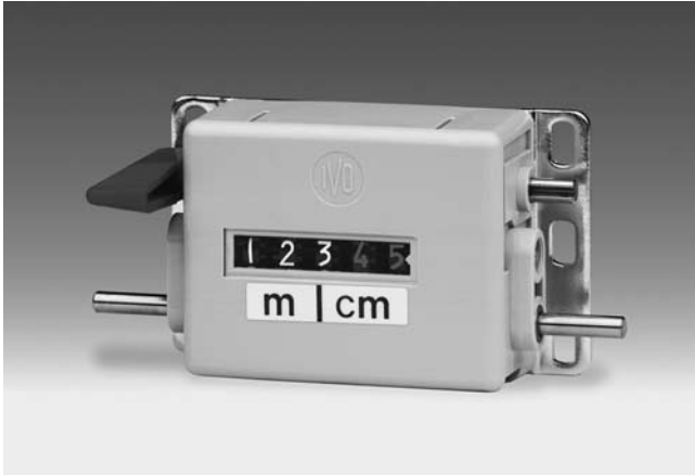
M 310.A - PTB Meter counter