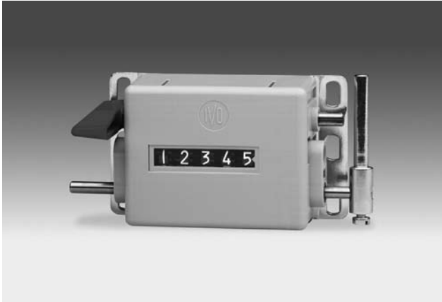
H 310 - Stroke counter