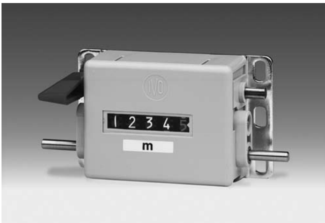
M 310 - Meter counter