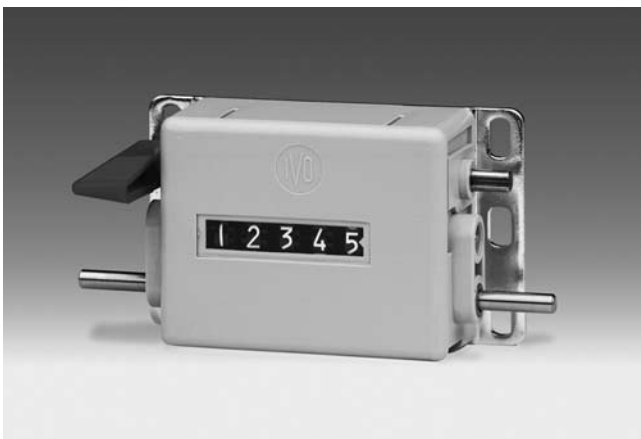
U 310 - Revolution counter